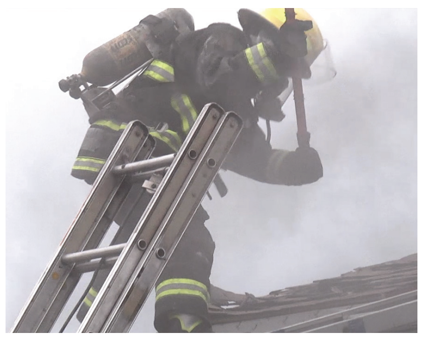
Short-duration exposure to high levels of HCN may be likely when firefighters perform horizontal and vertical ventilation.

The interior firefighters generally crawled below the smoke layer, lessening their exposure to HCN. Even so, the majority of the personal air concentrations measured from attack firefighters were well above the NIOSH short-term exposure limit of 4.7 ppm, and maximum levels measured from attack and search