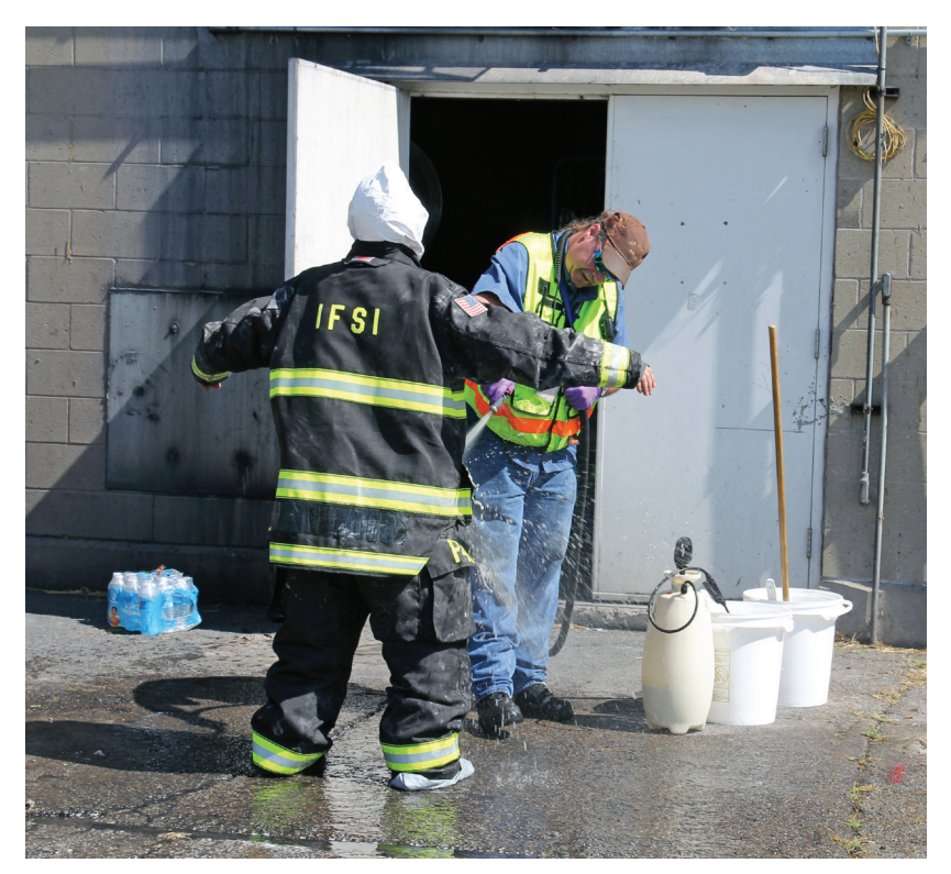
Wet-soap decon: Approximately 3 fluid ounces of dish soap was added to a 3-gallon pump sprayer and filled with water. A garden hose was used to pre-rinse the turnout gear. The soap/water mixture was then sprayed onto the gear and scrubbed with a stiff-bristled brush, followed by a final rinse.

We also wanted to measure the effectiveness of gross on-scene decon of turnout gear following the structure fires. Three types of decon methods were evaluated: 1) air-based decon with a modified electric leaf-blower; 2) dry-brush decon with a stiff-bristled brush; and 3) wet-soap decon with water and dish soap applied to the turnout gear, scrubbed with a brush and then rinsed. Of the three types of decon, wet-soap decon was by far the most effective, removing an average of 85 percent of PAH contamination present on turnout gear after firefighting.