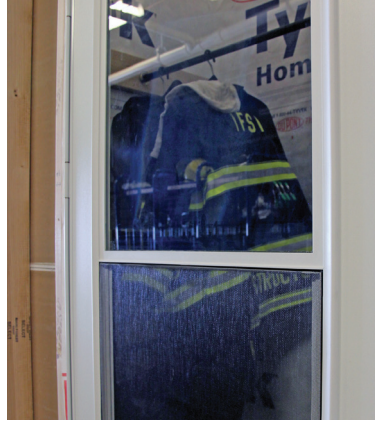
Six sets of turnout gear were placed inside an enclosed structure about the size of a modern apparatus cab.