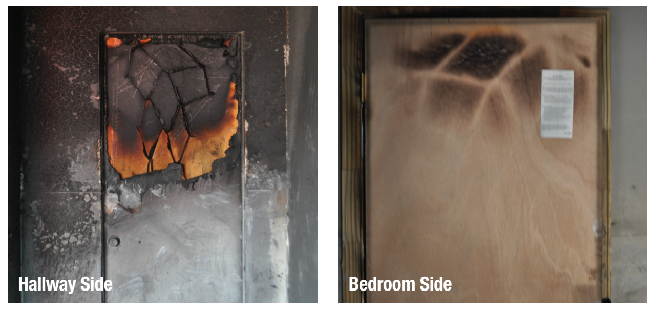
The hollow core interior doors that remained closed throughout the fire experienced significant thermal damage; however, the data showed tenable/survivable conditions for occupants on the side of the door opposite the fire.

It is equally important to realize that the interior doors experienced significant thermal damage during every burn scenario. In some cases, the doors' outward-facing skin was consumed and