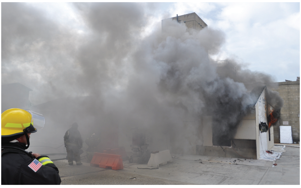
Fireground concentrations of benzene, total PAHs, and particulate were highest when collected downwind of the structure and when ground-level smoke was heaviest.

of depositing into the lower respiratory system where clearance mechanisms, such as increased mucous production and coughing, are less effective and lung inflammation can occur. These particles would likely be composed of a variety of toxicants, and at this location in the lungs, systemic absorption is likely, fur-